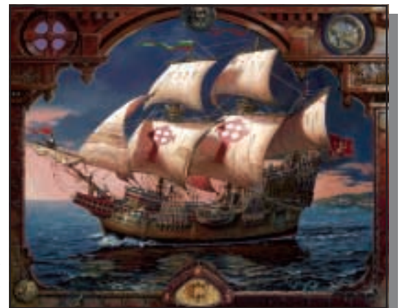
Voyage of the Fianna by Dean Morrissey 150 s/n giclée canvas 25" x 20" ~ $550.00 stretched