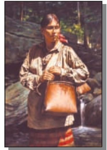
Water Girl by Robert Griffing 16" x 20" open edition ~ $40.00