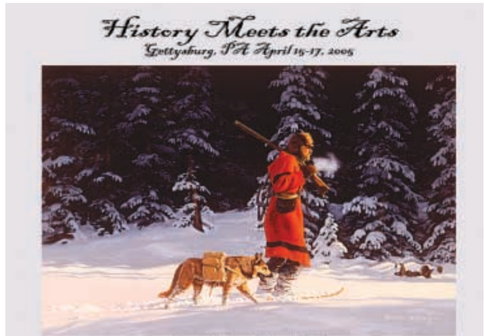
Moving His Traps by David Wright The Official Lord Nelson's History Meets the Arts 2005 show poster Poster size 20" x 16" ~ $35.00