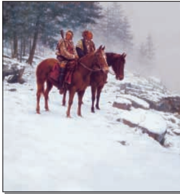
Lost by Robert Griffing 250 signed & numbered (s/n) giclée canvas 22 1/2" x 24" ~ $475.00 stretched

Here's a preview of some of the work you'll find by the following artists - ALL in person to meet you at The Gettysburg Fire Company during History Meets the Arts!