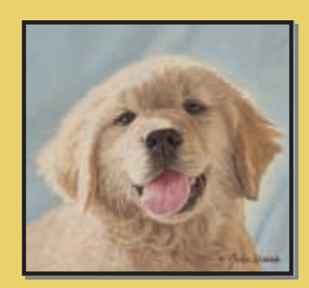
Let's Play - Golden Retriever Pup Need you say more? 8 <sup>3/4</sup>" x 8 <sup>1/4</sup>" ~ 550 s/n ~ $110.00