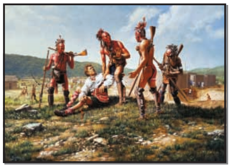
He Befriended Me Greatly 23 \frac{3}8'' \times 19'' \sim 950 \text{ s/n} \sim \$185.00

Indians and wounded. He later wrote, "I was immediately taken, but the Indian who laid hold of me