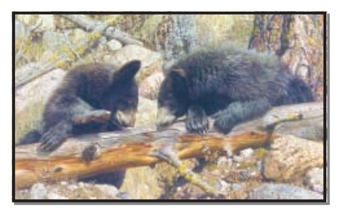
Double Dare Image size: 28 \frac{3}{8} \times 17 \frac{1}{4} Edition size: 650 \frac{s}{n} \sim $145.00