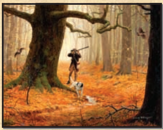
Thunder in the Woods 14″ x 11″ ~ 125 s/ n giclée canvas only ~ $175.00

To hear the thunder of those wings as a grouse explodes into the air, quickens the heart of anyone. To follow a good dog which locates and points the quarry is a satisfying experience for any hunter, regardless of the era in which it takes place.