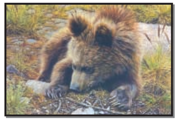
Bearly Awake Image size: 16 <sup>1/4</sup> x 11 Edition size: 1500 s/n ~ $95.00

Bearly Asleep Image size: 16 <sup>1/4</sup> x 11 Edition size: 1500 s/n ~ $95.00