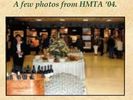
Ready for the crowds at the opening reception

the grounds outside the building. This is a nationally recognized art event, where over 70 artists gather for one weekend in this historic town, where History meets the Arts! Hope you can attend next year's show, April 15-17.