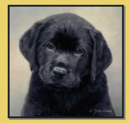
Heart & Soul - Black Lab Pup Irresistible 14<sup>1/2"</sup> x 14<sup>1/4"</sup>h ~ 550 s/n ~ $135.00