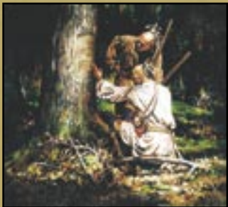
Wilderness News 125 s/n giclée canvas prints only Image size: 10" x 8" • $145.00