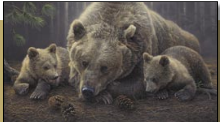
Limited to 100 s/n giclée canvas prints Image size: 30" x 17" • $595.00

with their offspring, in most instances for three years. Nature dictates when the young can fend for themselves."