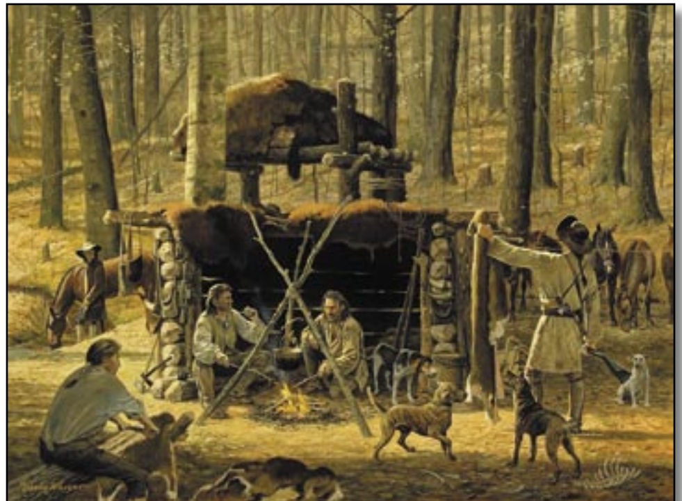
The Station Camp - Dogs and Deerskins by David Wright

1000 s/n paper prints • Image size: 23" x 17" • $150.00 125 s/n giclée canvas prints • Image size: 24" x 18" • $400.00