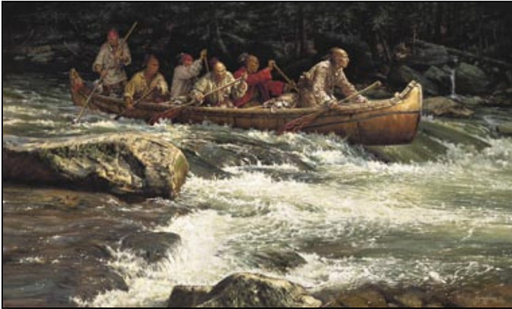
Into the Unknown by Robert Griffing

Life in the 18th century was a day to day challenge of one's abilities to survive. A simple paddle down a peaceful river could turn into a nightmare around each bend. The threat most often wasn't from the water but what may be on the shores.