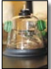
Pet Oxygen Mask.