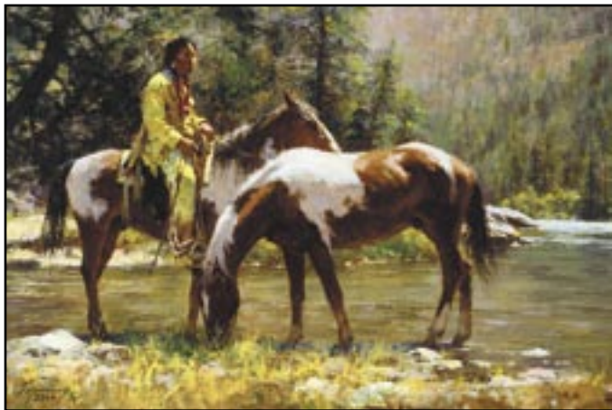
Solitude by Howard Terpning

550 s/n giclée canvas prints • Image size: 15" x 10" • $360.00