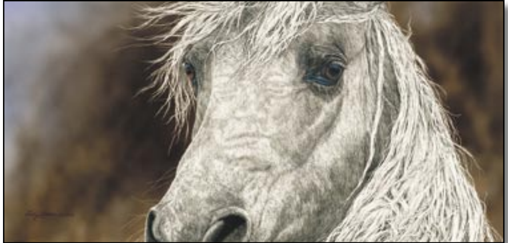
1000 s/n paper prints • Image size: 25" x 12" • $225.00 200 s/n giclée canvas prints • Image size: 28" x 13" • $545.00

In his final years, Sitting Bull proudly rode Circus Horse, a gift from Wild West impresario Wild Bill. Some scoffed at the horse, trained to act and dance in the renowned traveling show but, with the talent of any great leader, Sitting Bull recognized in Circus Horse the fire of a true noble spirit. This was the late 1800's, the time of the Ghost Dance, a ceremony to rid the land of white people and restore the Indians' way of life. The American government feared that Sitting Bull would join the movement and bring the Lakota with him. Indian police were sent to arrest him, and a battle quickly ensued. At the sound of bullets, Circus Horse began the act he had been trained to do: a dance of pawing the