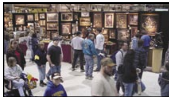
Photo of our 40' booth at the Sportsman's Show in Harrisburg