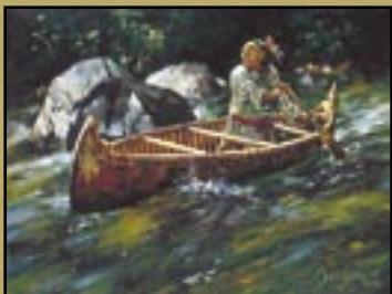
Rapids Ahead 125 s/n giclée canvas prints only Image size: 10" x 8" • $145.00