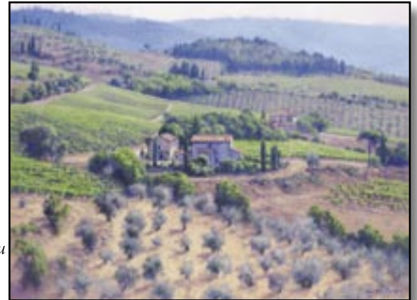
250 signed & numbered giclée canvas prints Image size: 32" x 24" • $725.00