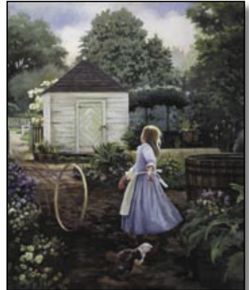
Freedom by Pamela Patrick White

It is what we cherish most. Freedom for ourselves and for our children. So that they may grow up with the capability to choose their own paths, be their own persons. But like our children, freedom must be nurtured. It must never be taken for granted, for it can slip through our fingers and lost for generations to come.